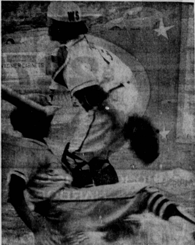
SCRAMBLE AT HOME . . . The Senators won the first half of the Tordondo Little League major division last week and got off to a winning start in the second round against the White Sox. Here a fifth inning run scores for the Senators. Nine Little Leagues in Torrance are in the second half of the baseball program with more than 3,000 boys participating.