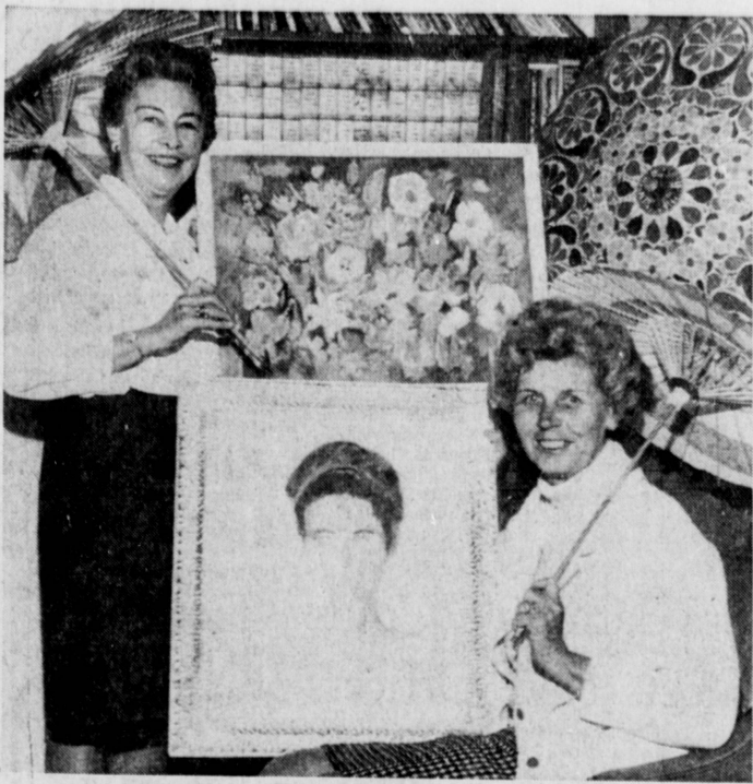
Preview of What's To Come

vels orator 3c 00 ptic ers c DOOR g Kit on flag, 6 ft. rope hal- 3.49 27c Flag 27c section of the All with 3- ended patent 2.88 "Seventeen" o-go" trims, ent and se- 1.99 elettes tains special to use in the cleanses 59c Powder free-flowing d deodorizes 1.29 Trays paper-mache Plastic edges ce of designs 59c ONI speeds up Gives you look. Con- 1.49 mant hair- Color for covers gray 2.00 USE NE with action! by ONE 3.09