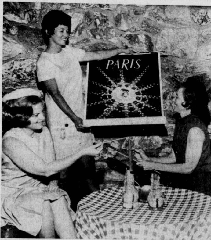
In a French Setting

The artists have increased their activities by entering shows individually and as a group and in many invitational shows.