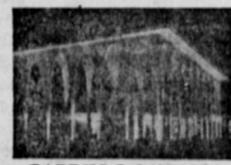
CABRILLO SAVINGS Pacific Coast Hwy. and Crenshaw