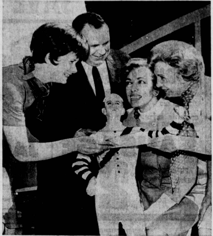
Volunteers For Children