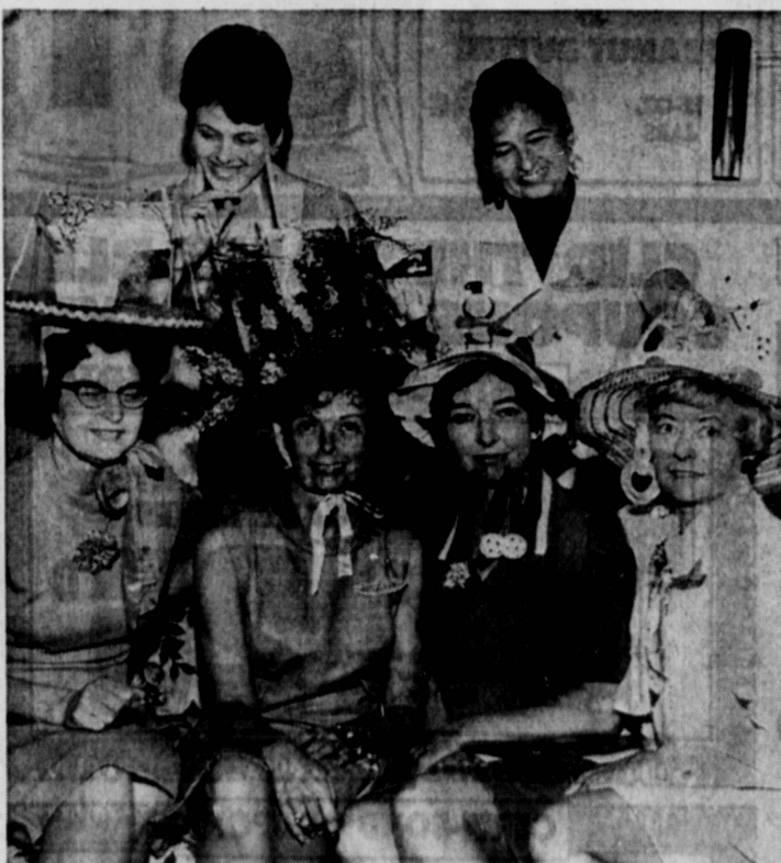
A Fantasy In Creative Headdress