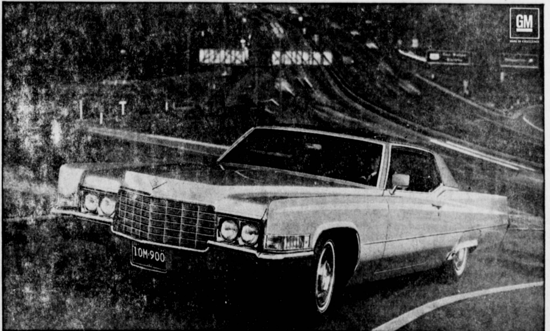
The 1969 Coupe de Ville, Cadillac Motor Car Division

If it's the only time you have to yourself, make the most of it.