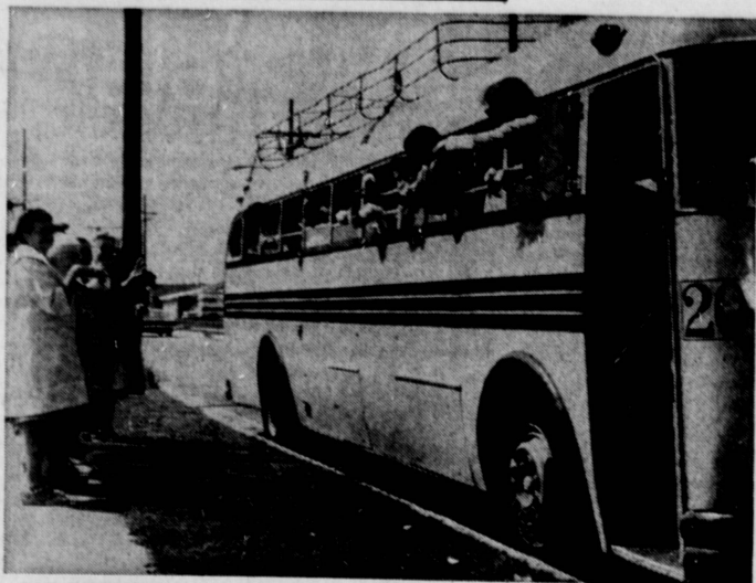
SAY GOODBYE . . . Mothers wave goodbye to some 50 retarded children and their chaperons as they take off for a trip to Universal Studios. The social event was co-sponsored by the Southwest Association of Retarded Children and the Los Angeles County Department of Parks and Recreation.