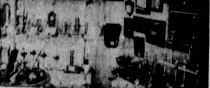
Display of Trophies and Plaques at Mooers and Alexander

When superior performance demands superior recognition, the award to fit the achievement can be found at the Mooers and Alexander Trophy Company in Downtown Torrance.