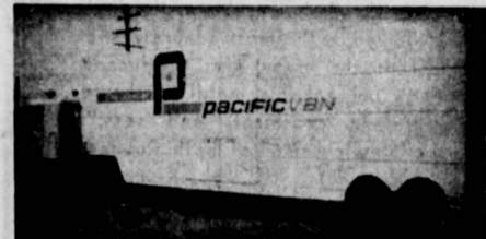
The Name of Dependability

"Leave the moving to us" is some excellent advice offered by the Pacific Van and Storage Company, an agent for the nationwide Greyhound Van Lines.