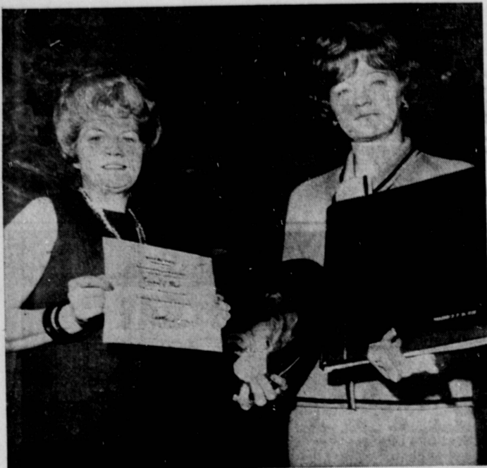
Win District Bouquets