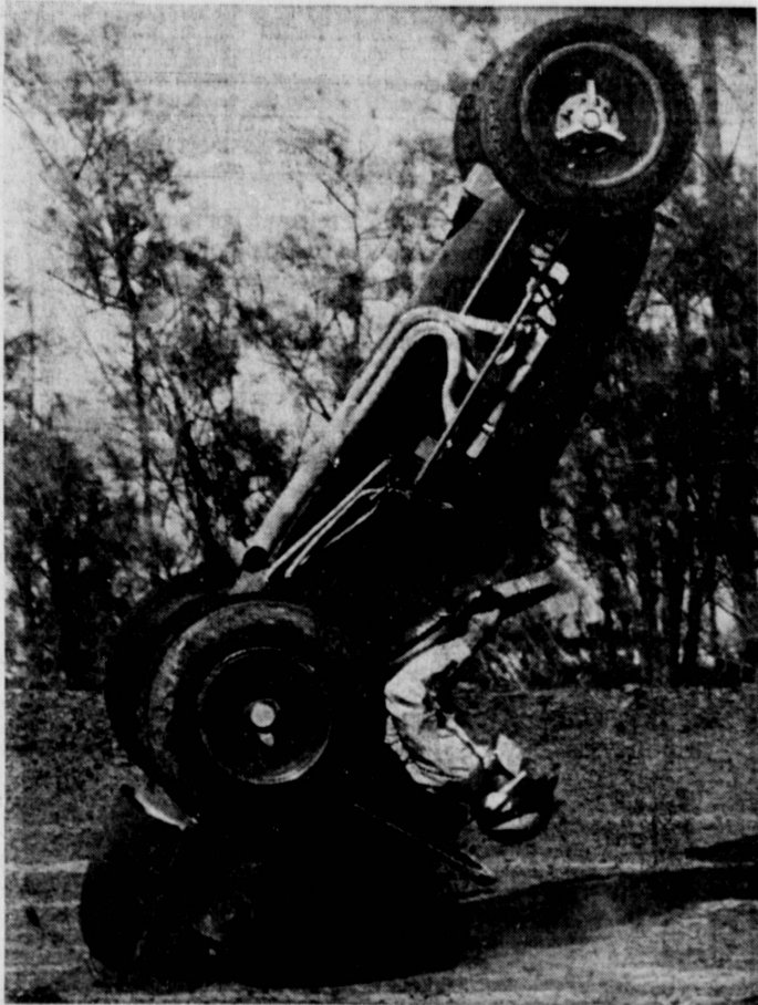
WHAT IS SPRING—WITHOUT AUTO RACING? . . . Going all out at Gardena's Ascot Park is race driver Bud Gilbert, a participant in a recent Sunday afternoon sprint car race. With warmer climate ahead, a full schedule of auto and motorcycle racing is on tap at the track.