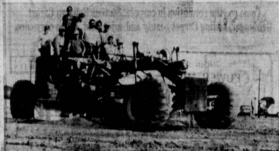
START OF A JOB . . . Although the Little League baseball season is getting under way for most leagues at the moment, the Southwood National Little League spent the weekend grading its new ball