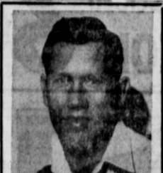
WALLY FRANKLIN TV SERVICE