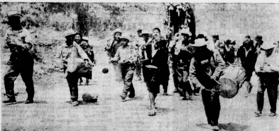
GOING TO MARKET . . . A festive mood is apparent among the Indians bound for church and the market place in Chichicastenango, Guatemala. Before going into the Christian church, however, the devout will perform their pagan ceremonies so that the worshippers