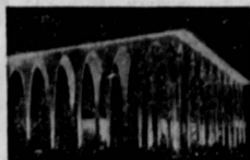
CABRILLO SAVINGS Pacific Coast Hwy. and Crenshaw

Why not visit the beautiful arched building at Crenshaw and Pacific Coast Highway and get the interest you deserve.