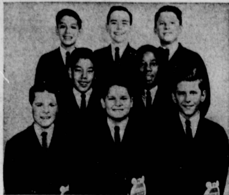
SINGING BOYS . . . The Mitchell Singing Boys will be featured at Easter sunrise services at Green Hills Memorial Park in San Pedro. The eight boys, ranging in age from 9 to 14, are well known from their frequent TV appearances, movies and concerts. Services will begin at 5:41 a.m. Easter Sunday, at the Memorial Park, 27501 S. Western Ave., San Pedro.

Church school classes and a nursery for infants will be provided during both of the worship services.