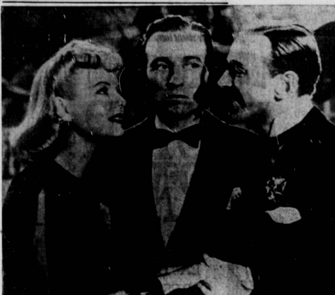
SATURDAY MOVIE ... Thrifty Drug and Discount Stores will present "Holiday Inn" starring Bing Crosby, Fred Astaire, Marjorie Reynolds, Walter Abel and Virginia Dale Saturday on Channel 5's Saturday Night Movie. The song "White Christmas" won an Academy Award when the film was first released. A song and dance man decides to turn a Connecticut farm into an inn, open only on holidays.