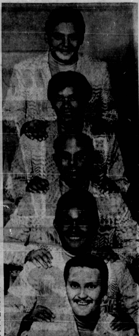
INITIAL APPEARANCE . . . Initial appearance on the mainland, that is. They're The Allis, appearing nightly at the Latitude 20 in Torrance starting Tuesday, July 1.