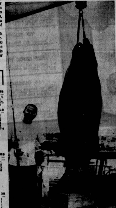
A WHOPPER ... Fishing off the fishing boat Pursuit, Tommy Tucker caught a 355 pound black bass off the Santa Barbara Islands and is pictured hoisting the fish at King Harbor.