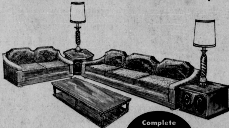
THE EL REY

This complete room group made to sell for $649.95 WAREHOUSE SPECIAL. 459 95