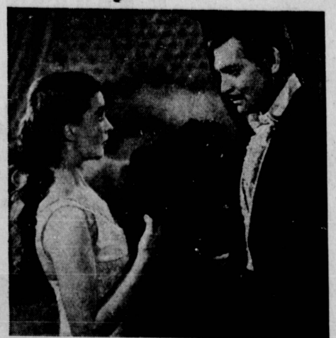
VIVIEN LEIGH in her memorable role as Scarlett O'Hara with Clark Gable as Rhett Butler in David O. Selznick's production of Margaret Mitchell's "Gone With the Wind," now presented by Metro-Goldwyn-Mayer in new Wide-Screen and Metro-color splendor.

By the way, the Golden Gal- leon restaurant there will re-open soon.