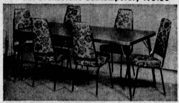
7 Pc. Black Mediterranean $79.95