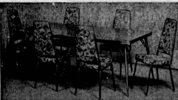
7 Pc. Bronzetone Contemporary $79.95