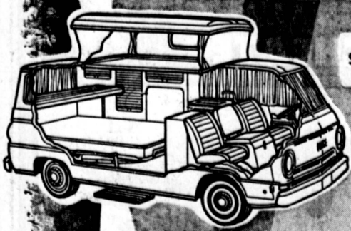
A108 FAMILY WAGON (Made up for night)

SEE THEM ALL - THIS WEEKEND DEC. 5-6-7-8