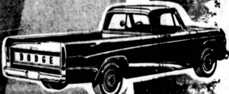
DODGE Swept Line Pickup

IDEAL MATE FOR THAT NEW SLIDE- ON CAMPER.