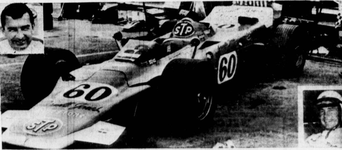
TURBINE TEAM . . . Parnelli Jones and Joe Leonard, both fa mous for failing to win the Indiapanolis 500-mile race because of mechanical failure, have their STP Lotus Turbine No. 20 and 60