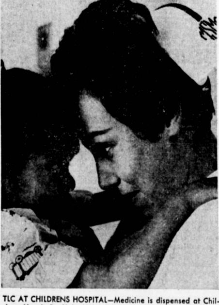
drens Hospital, a United Way agency, along with great amounts of tender loving care. United Crusade funds support the services provided by 244 agencies of United Way and the many services of 12 American Red Cross chapters.