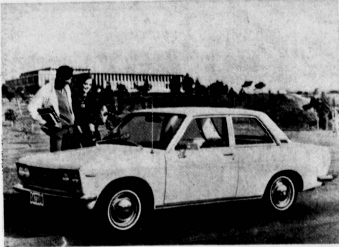
NEW DATSUN . . . Many new features have been incorporated into the 1969 Datsun, including an overhead cam engine, disc brakes, and a fully independent rear suspension, as standard equipment. Torrance Datsun, 29710 Hawthorne Blvd., is currently showing the new models.