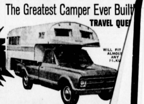
The Greatest Camper Ever Built TRAVEL QUEEN

NEW FOLD AWAY SAF-T-JACKS Are standard equipment on all Travel Queen Campers. See them today!