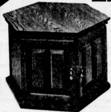
Hexagonal Commode (30"x30"x19" H.)

Accent tables of rare beauty and superb quality. Each a masterpiece in its own right. Note the dramatic raised block designs, bold Spanish wood grain, weathered brass hardware and magnetic door catches. The matching tops are of rock-hard plastic that resists cigarette burns, stains and marring. Accept this invitation to gracious living in the Old World Spanish manner.