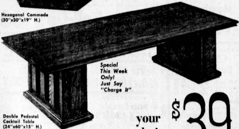
Double Pedestal Cocktail Table (24"x60"x15" H.)

Special This Week Only! Just Say "Charge It"