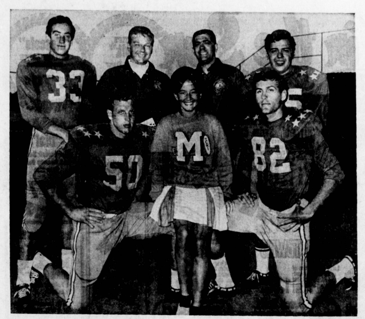
FAMILY PLAN . . . Going together to Thursday's Lions All-Star Football Game at El Camino Stadium are the folks at Bishop Mont-gomery High School, Representing the school in the game are