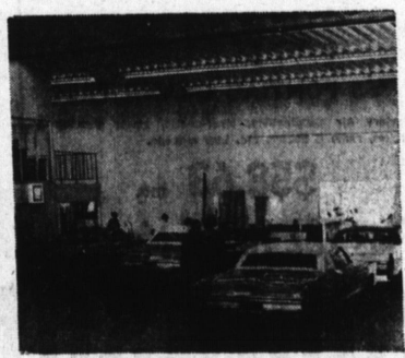
The large service entrance gives the king or the queen ample space to drive to the service adviser who attends to your Cadillac