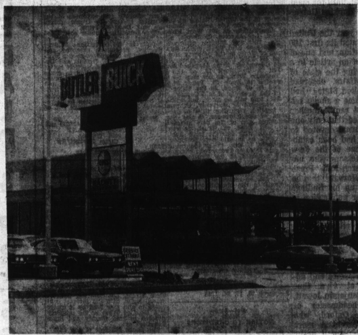
The New ... 1968!