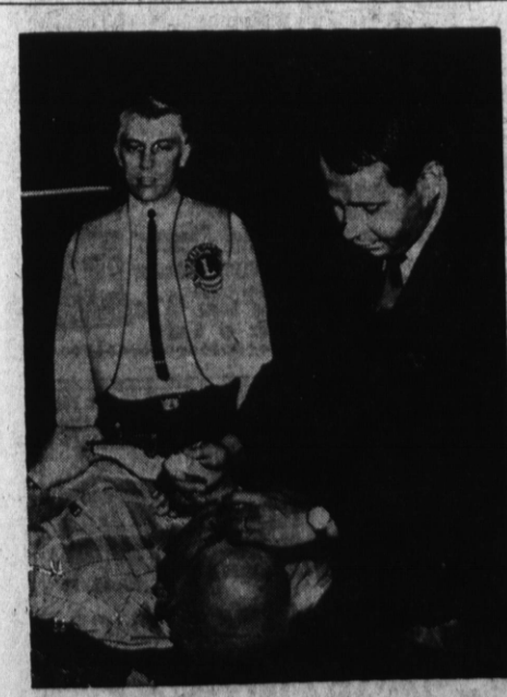
dent of the Downtown Torrance Lion's Club, watches as a local physician performs a glaucoma eye test on one of the 200 persons examined during a recent Senior Citizen Health screening day. The event was sponsored by the Lion's Club, which sponsors sight conservation programs in communities throughout the warld.

Is alcoholism a disease? How can the alcoholic be treated? Is there a cure? Read the booklet "Alcoholism — Hope and Help," by Ann Landers Enclose 55 cents in coin with your request and a long, stamped, self-addressed envelope. Ann Landers will be glad to help you with your problems. Send them to her in care of the Press-Herald, enclosing a stamped, self-addressed envelope. (C) 1965, Publishers-Hall Syndicate