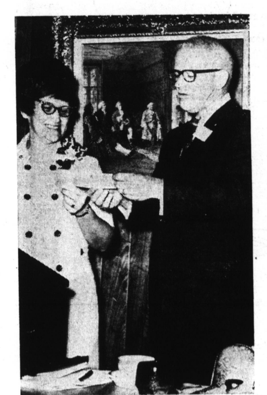
Gear for New