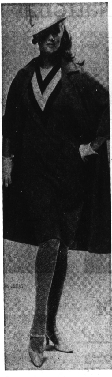
KNITS MADE NEW

Fashioned in California by Mr. Blackwell this elegant after-five creation is boxed in scallops of navy silk worsted and jewelled in white chalk and crystal v's. This short formal, made for dancing, comes in navy, white and candy pink