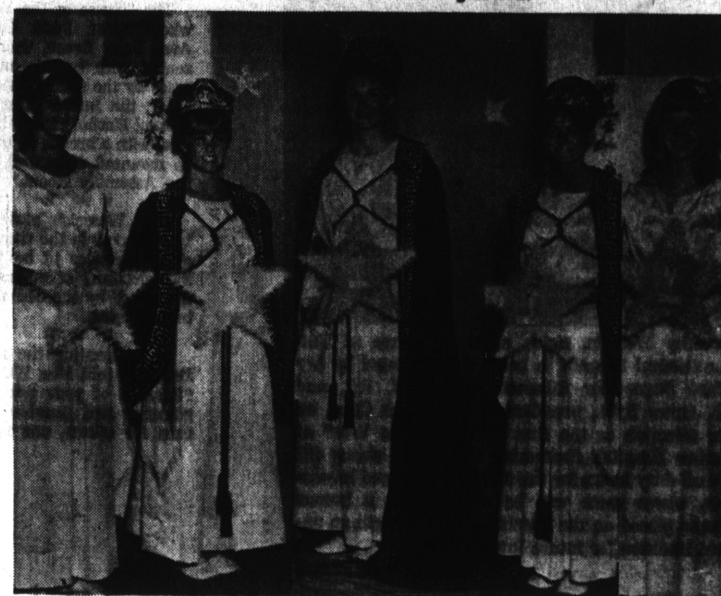
QUEEN AND HER COURT