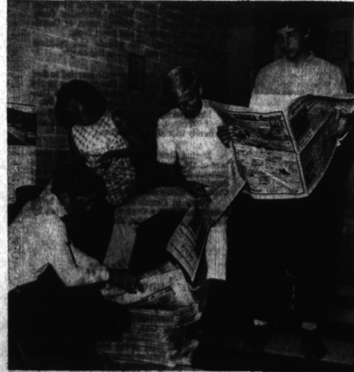
MEMORIES IN PRINT