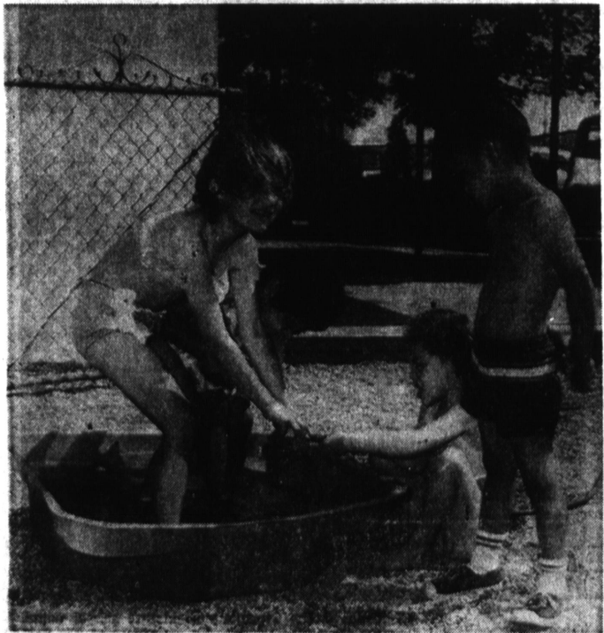
SCHOOL IS OUT