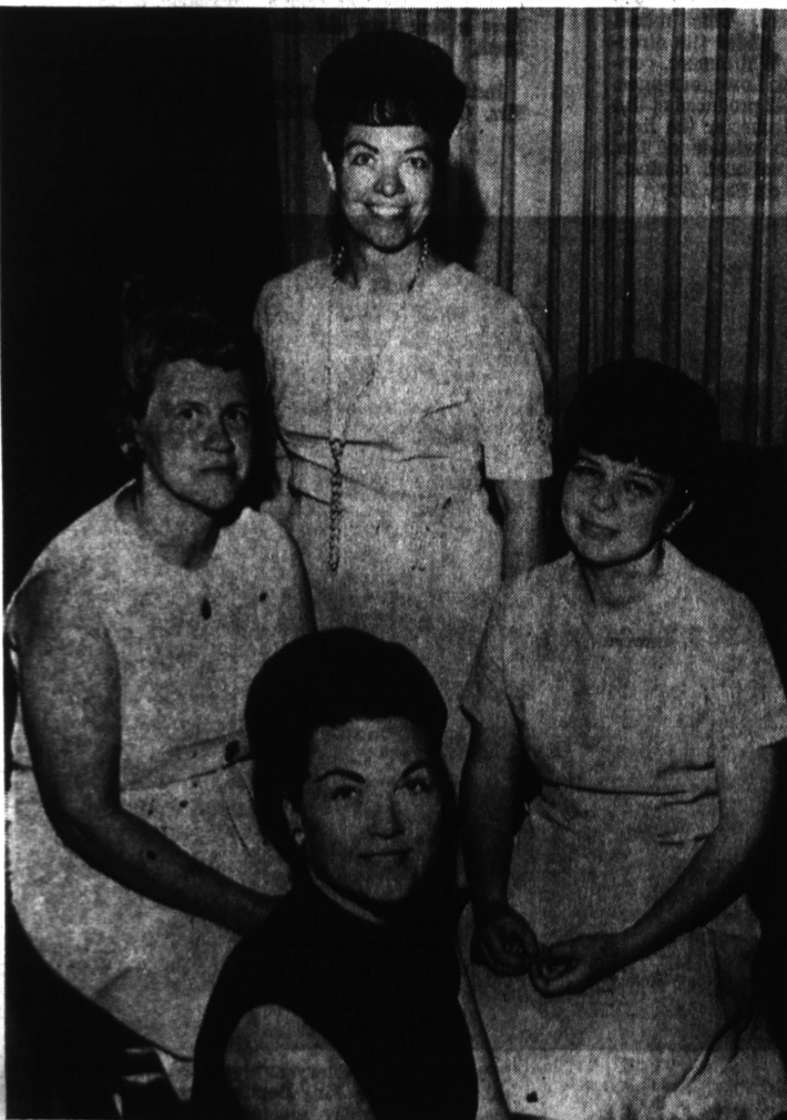
TO LEAD CHURCH WOMEN

444 E. CARSON BETWEEN AVALON &amp; MAIN DAY OR NITE 830-8533