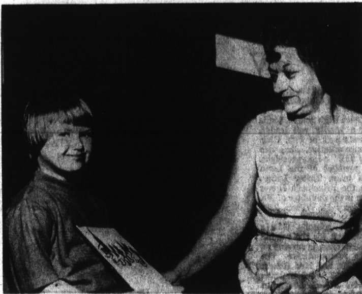
VISITS WITH DIGNITY