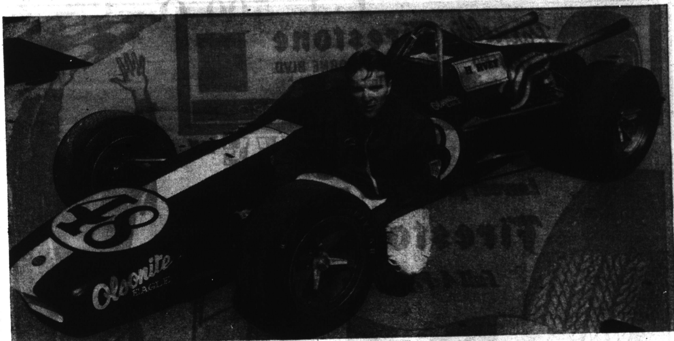
READY FOR ACTION . . . Dan Gurney, one of the nation's great auto drivers, will be in Row 4 in the Indianapolis 500 Mile Race

and will compete in his Olsonite Eagle-Gurney Weslake car in tomorrow's Memorial Day spectacle.