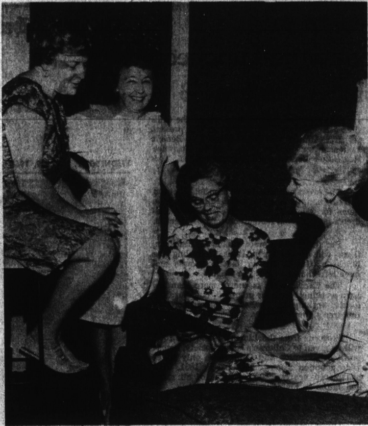
LOOK TO THE FUTURE