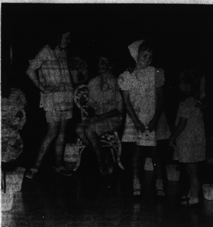
MOTHER-DAUGHTER FASHION EVENT