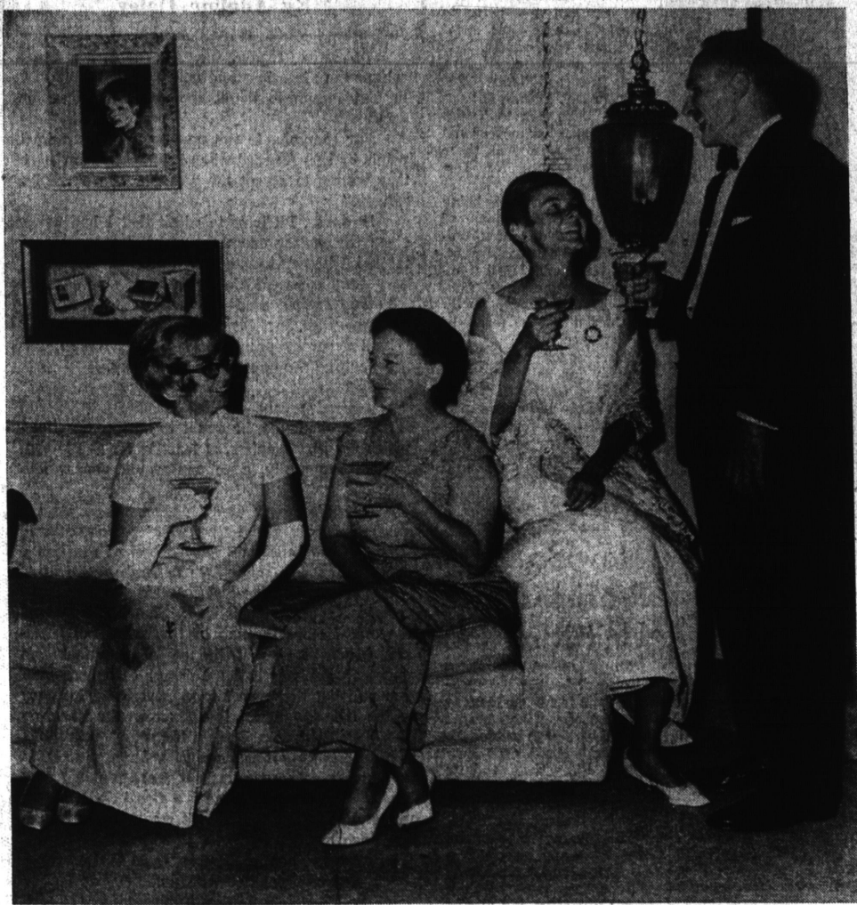
Before The Ball