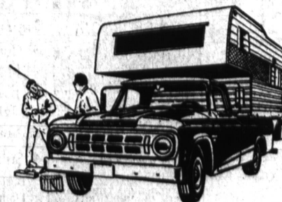
SWEPT LINE CAMPER SPECIAL