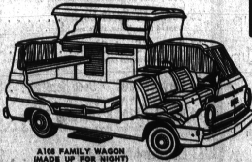
A108 FAMILY WAGON (MADE UP FOR NIGHT)