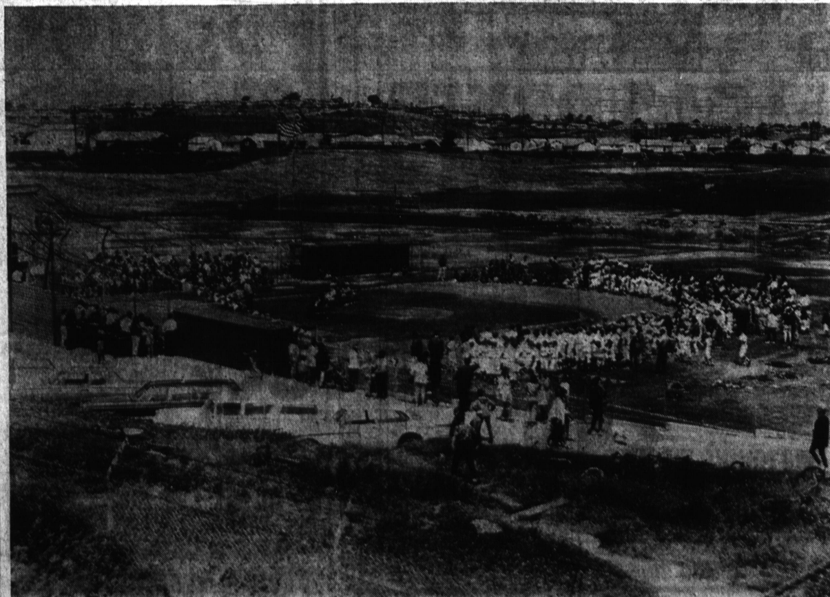
which they live, more than 400 Tordondo Little Leaguers gathered at the ballpark in the Entradero Park area for opening-day Saturday.

White Sox ..... 002 730 000-12 6 4 Dodgers ..... 301 322 002-14 13 4 Little, Munson (7), and Munson. Little, Collie, Hansen (4), Gentile (7) and Mondt.