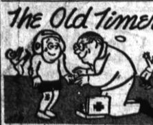
"If you haven't a few friends you just haven't been playing the game."

Taking part in this year's performance from the United States 1968 Olympic and World team pair skaters are