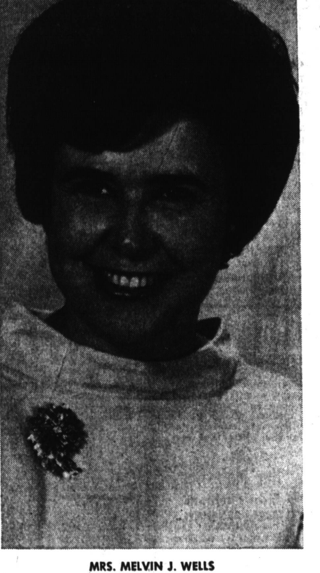
New Auxiliary President