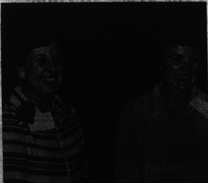
A CORDIAL WELCOME