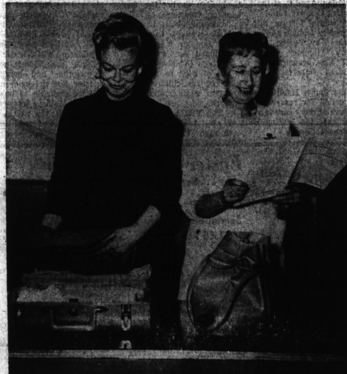
Ready For Weekend Workshop