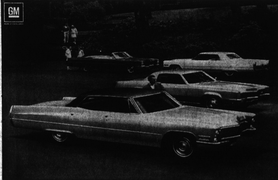
From left: 1968 Hardtop Sedan deVille, 1967 Fleetwood Eldorado, 1968 Coupe deVille, 1968 deVille Convertible.

Your choice of Cadillacs gets better every year.