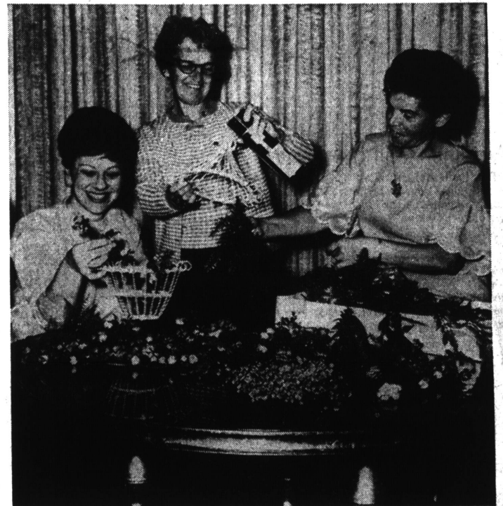
City of Hope Benefit