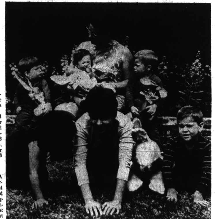
Easter Breakfast, Egg Hunt