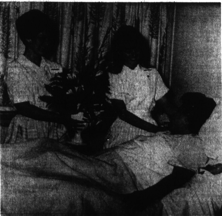
Marigolds Serve with Pleasure