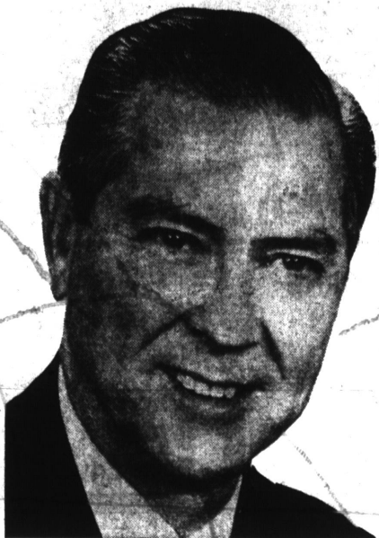
FORMER ASSISTANT CITY MANAGER