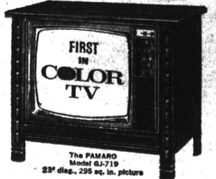
The PAMARO Model 6J-719 23" diag., 295 sq. in. picture

RCA Color TV WITH AUTOMATIC FINE TUNING (AFT)