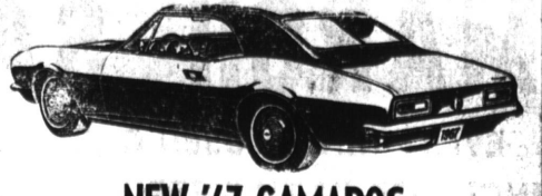
NEW '67 CAMAROS

Over 65 in stock, all colors, all options. Including 396 4-speeds.