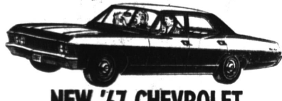
NEW '67 CHEVROLET