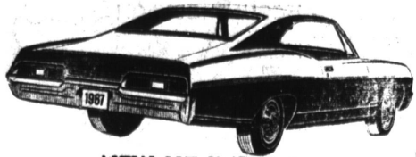
NEW '67 IMPALA SPORT COUPE

Stock 647. Powerglide, tinted windshield, factory air, power steering, full safety group.