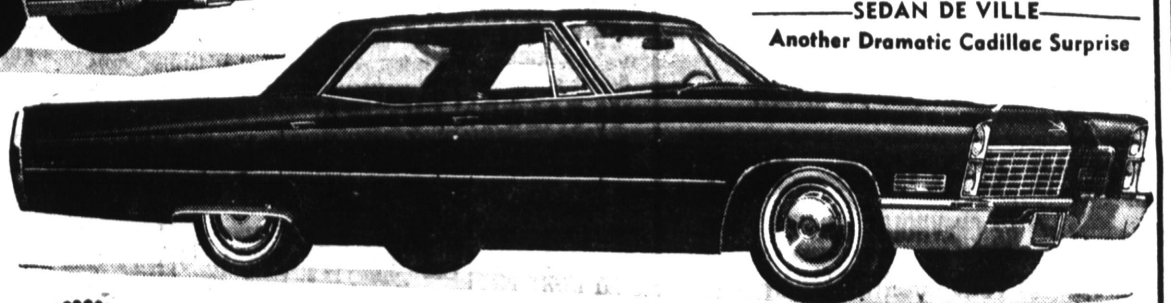
SEDAN DE VILLE Another Dramatic Cadillac Surprise

Buy or Lease Your 1967 Cadillacs From Ronald E. Moran Cadillac